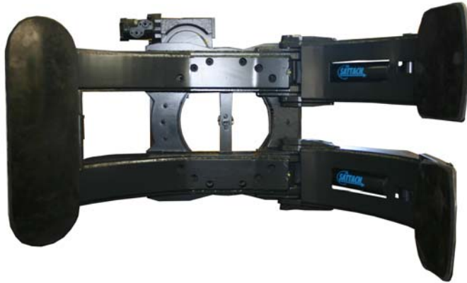
PRC model shown